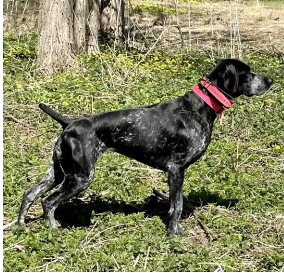
UKC BIS UKC Ch Windheim's Raven-Haired Beauty RA, CAA, BCAT, DN, CGC, TKI

As some of you may know, I am involved with the most recent petition presented to the GSPCA proposing a change to the German Shorthaired Pointer Breed Standard that would remove the color black as a disqualification and make it an acceptable color for the breed.