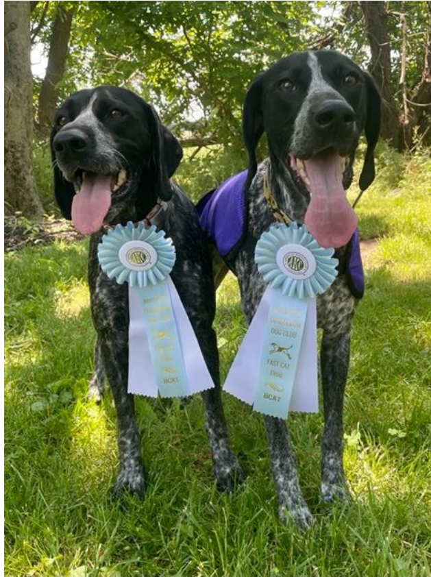
Littermates Windheim's Raven-Haired Beauty and Windheim's Wild Card get their BCATs together!