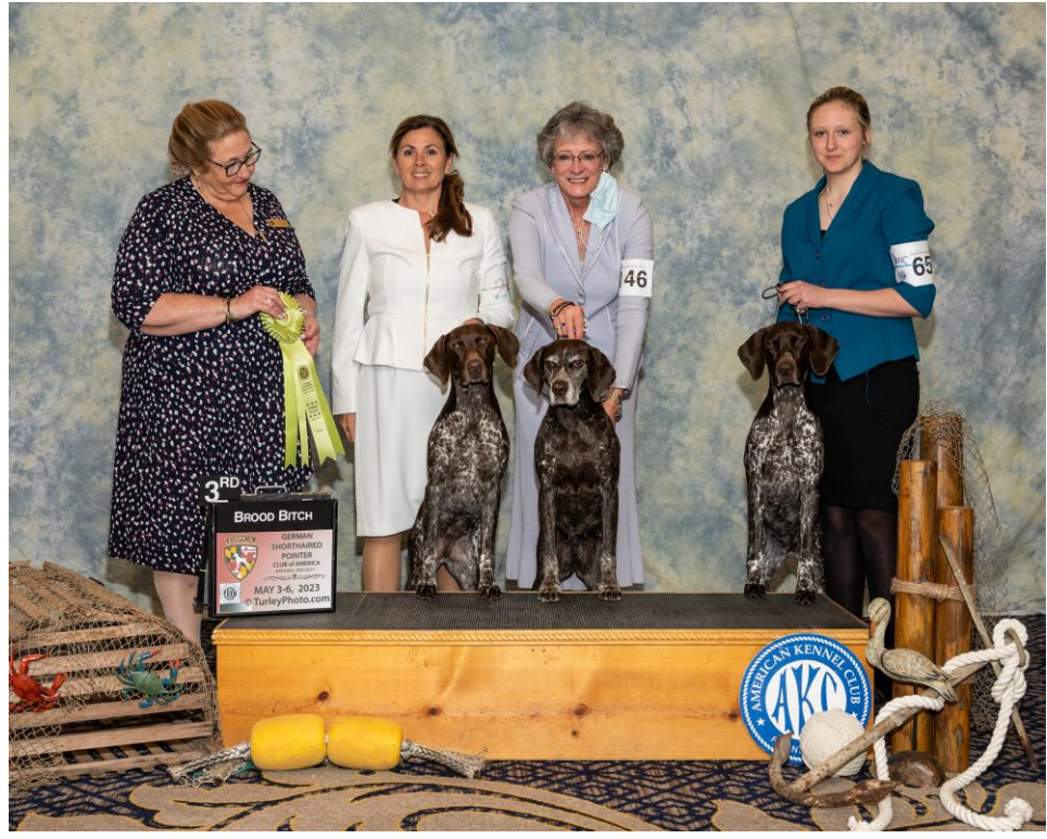
Twiglet with Fulham and Lyra 3rd place brood bitch