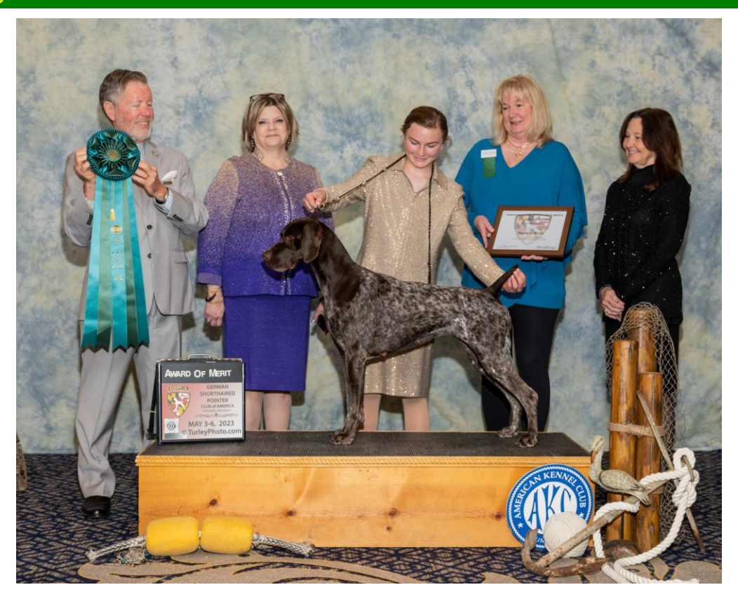
Nationals was a great week and we came home with lots of ribbons: