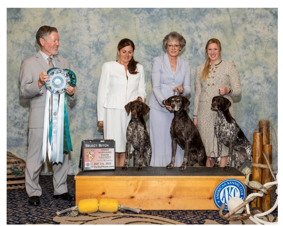
Twiglet, Fulham and Pickle all in the ribbons at the Nationals

Stonehill's Misery Business AKA Pickle: AOM at the Mason Dixon Specialty AOM at the GSPCA Regional Specialty Best Owner Handled at the Top 25 Gala Select Bitch at the GSPCA National Specialty Select Bitch at Westminster Kennel Club Dog Show